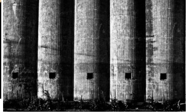
Abandoned Grain Elevator

The strong vertical pattern of these abandoned grain elevators creates a dynamic tension. Using the MC Picture Control and increasing the contrast serves to highlight the "lines within lines" of the texture of the concrete. Leaving the plants in the foreground adds a bit of an organic element to an otherwise harsh composition.